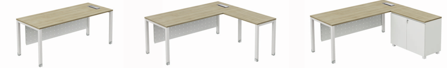
Main table - 1500/1800L x 750D x 750H, Return table - 900L x 500D x 750H, Storage - 900L x 400D x 750H