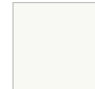
Everest White (D. No 1102)