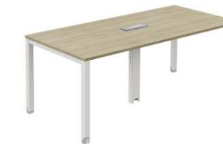
2400L x 1200D x 750H 1800L x 900D x 750H