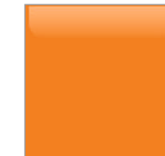
Sunny Orange (SG 001)