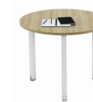
900 Dia x 750H