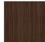
Lorraine Walnut (D. No 3007)