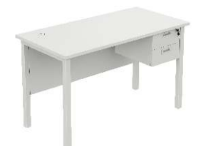
1200L x 600D x 750H