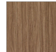
Persian Walnut (D. No 3371)