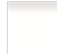
White (SG 011)