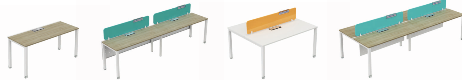
1050/1200/1350/1500L x 600D x 750H (1050 with screen)