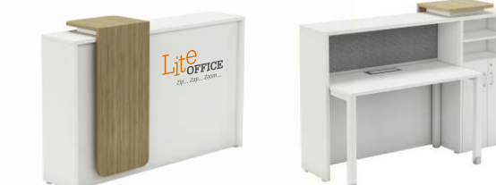
Counter - 1800L x 400D x 1140H, Table - 1200L x 600D x 750H with integrated storage unit of 520L x 330D x 750H