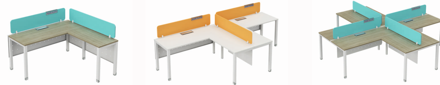
1500L x 600D with 900L x 500D return, 750H (1050 with screen)