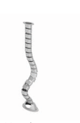
Vertebrae (wire manager)

*Workstations, cabin tables and meeting tables include access flap (300 L X 120 D) on main table