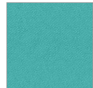
Vesuvius (MS 410)