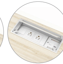
Access flap for easy wire management