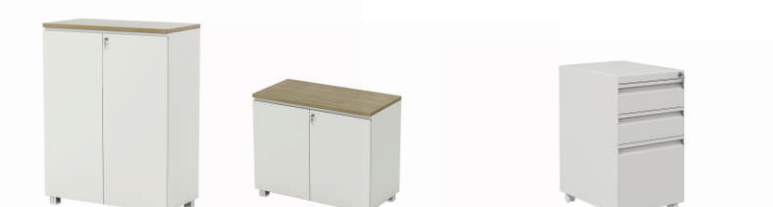
Storages - 900L x 400D x 750/1200H