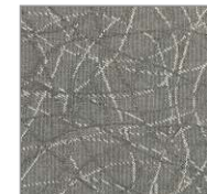
Grey Gargoyle (NE 814)