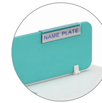
Privacy screen (fabric/glass) with name plate