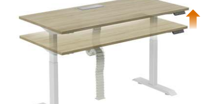
1500 x 750mmH Height adjustable upto 1050 H