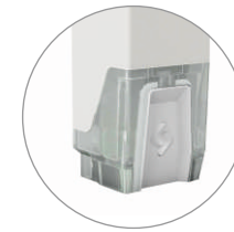
Trendy Signature leg with translucent shoe